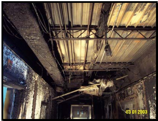
Figure 2 - Damage in Corridor

This subtle but potentially important detail is crucial since it can be a deciding factor when determining if this facility, even when defined as existing, would have required an automatic sprinkler system. Table 19.1.6.4 from NFPA 101 only permits Type II unprotected construction for single story facilities that are protected with sprinklers.