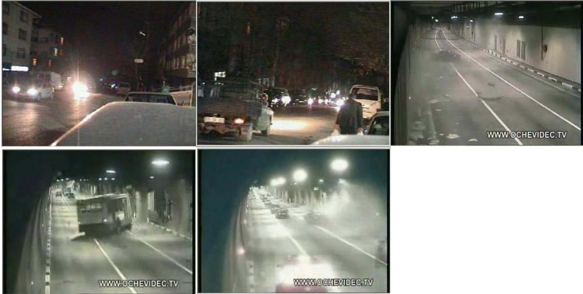
Figure 3. Snapshots of the video clips without smoke