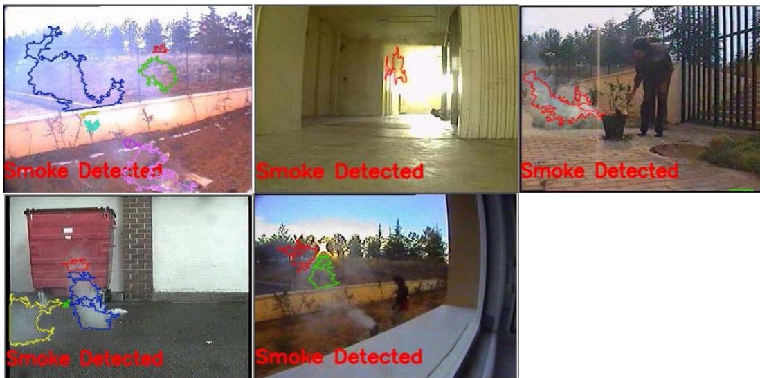
Figure 2. Sample images showing the detected smoke regions

Although no false alarms are issued in videos that do not have smoke, shown in Fig. 3, there are false alarms in some of the smoke video clips.