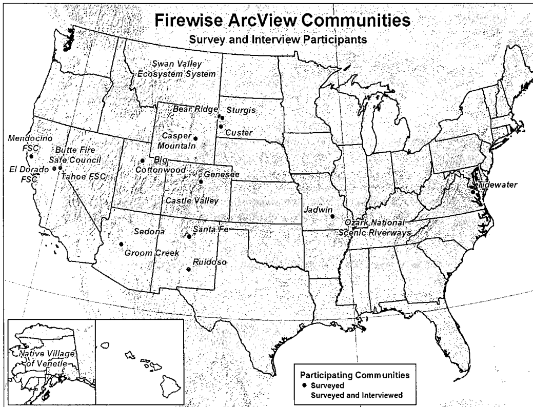
Figure 1-1. Firewise ArcView and Firewise USA Program community participants, 2000 – 2004