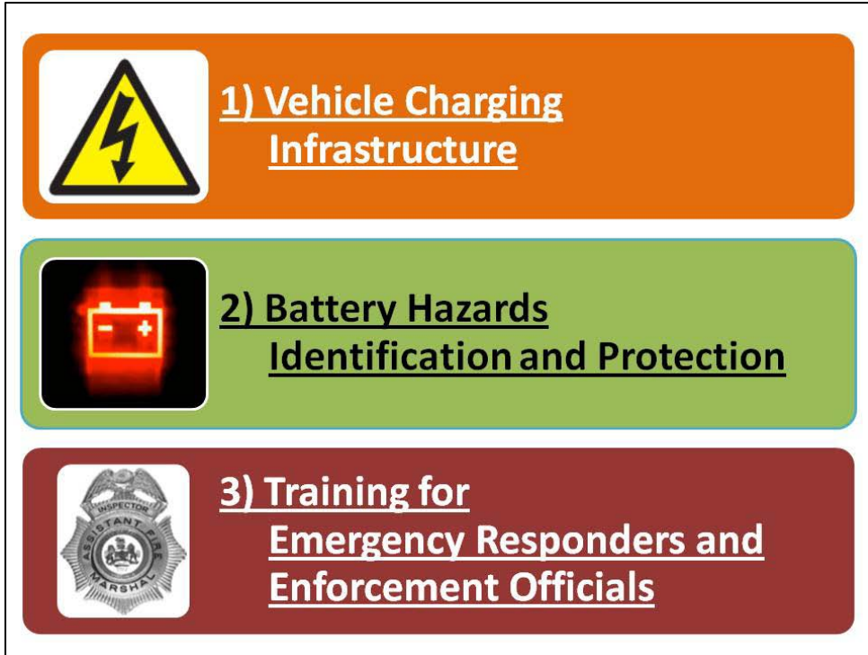
Figure 3: Topics Identified for Action Plan Consideration as a Result of the U.S. National Electric Vehicle Safety Standards Summit

With these topic areas as a backdrop, additional consideration for an action plan should likewise address the significant positive networking component that has established valuable dialogue between important constituent groups on certain critical issues. This translates to continuing the facilitation of this dialogue on all levels as an important action item resulting from the Summit. Further to this point of maintaining constructive dialogue going forward, planning should be considered immediately for a similar follow-up Summit in the near future, such as next year.