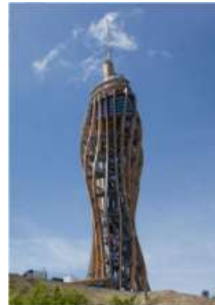
Pyramidenkogel, Carinthia, Austria (Pyramidenkogel, 2013)