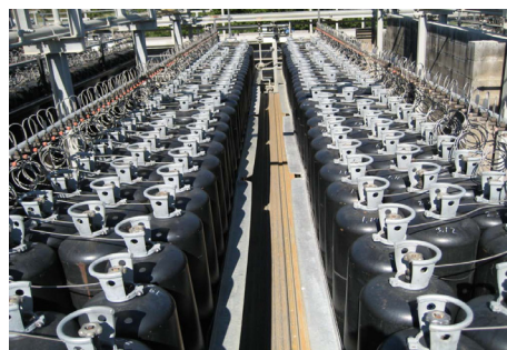
Figure 2 – Large quantity of cylinders nested on a trailer

cylinders are not quickly cooled, the fusible metal plugs will continue to melt allowing the fire to quickly spread from cylinder to cylinder throughout the array. (See Figure 2).